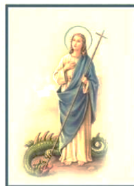
Saint Martha Pray for Us

July 29 th marks the Feast Day of Saints Martha, Mary, and Lazarus. In February 2021, Pope Francis declared a combined Feast Day to celebrate the three siblings. The three are the patron saints of siblings. They are three siblings who were close friends of Jesus. Pope Francis stated that, "In the household of Bethany, the Lord Jesus experienced the family spirit and friendship of Martha, Mary and Lazarus, and for that reason the Gospel of John states that he loved them." St. Martha loved to host Jesus and prepare meals for him, whereas St. Mary loved to listen to his words. Upon the death of Lazarus, Jesus raised him from the dead.